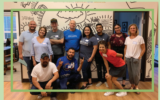
Elevations Credit Union staff participated in a Conversation Team activity with students from a Level 6B class in Longmont.