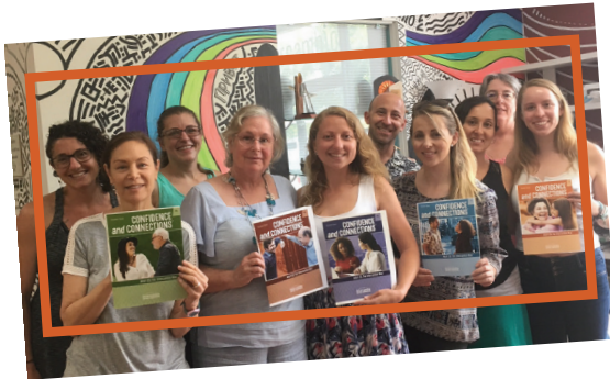
Staff members proudly present the new covers of Confidence and Connections .

This new curriculum was conceived, developed, and implemented by Intercambio staff with outside support. The deep understanding the staff has for both students and teachers, along with their extensive experience in ESL education, made them the perfect team to deliver on the organization's vision.