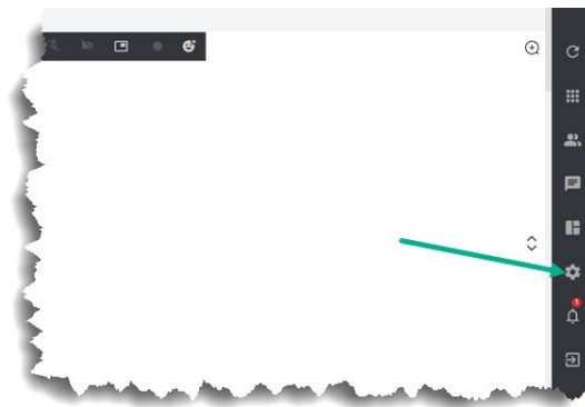
Figure 1 Settings icon in the classroom window

If you are experiencing poor video quality in the online classroom, troubleshoot your video settings at any time by adjusting the media controls in the Settings menu.