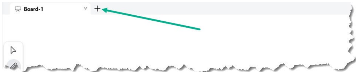
Figure 1 Add Apps Menu Option

Result: The dropdown list of available apps displays.